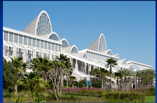
Orange County Convention Center