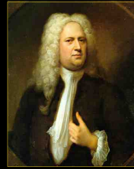
George Fredrick Handel